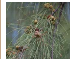
Casuarina (She-oak) Extracts