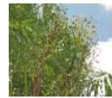
Chinese fan-palm Extracts